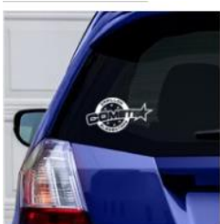
Comets Car Decal - Car Decal